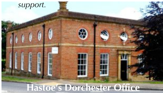
Hastoe's Dorchester Office

organisations. Magna is one such company which still has homes in our area but it was soon discovered that Hastoe Housing Association was the best game in town - and they favoured our steering committee's approach for finance, and the way the project had good community support.