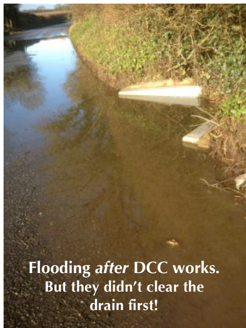
Flooding after DCC works. But they didn't clear the drain first!

we can sustain at least a minimal lengthsman service from our own limited budgets without increasing our precept through the roof are well underway. Your council is determined to sustain our good work to date; after all with the drains cleared, it will take time for branches to block them once more so we have valuable time to take action - unless we get a serious weather change of course.