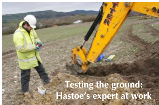
Testing the ground: Hastoe's expert at work