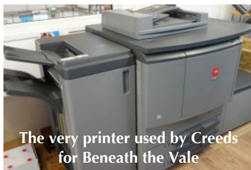
The very printer used by Creeds for Beneath the Vale