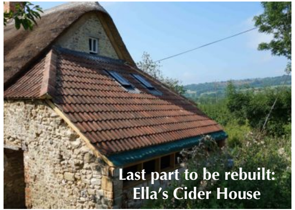
Last part to be rebuilt: Ella's Cider House