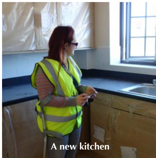
A new kitchen

Over the next few months the Directors of the CLT will be giving thought as to what should be the next project that will improve the community.