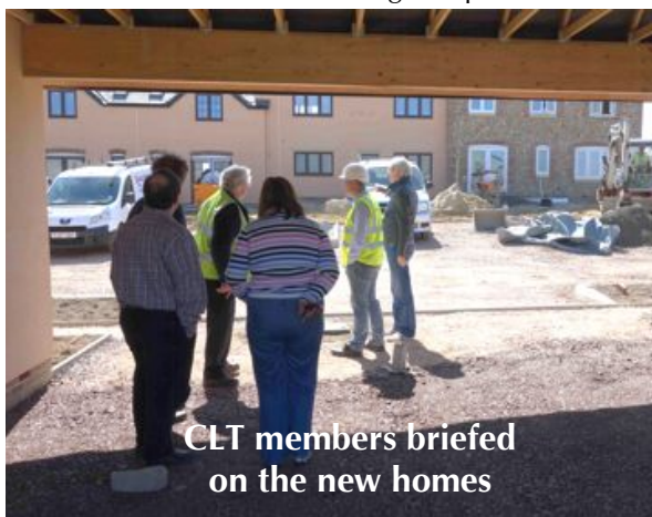
CLT members briefed on the new homes