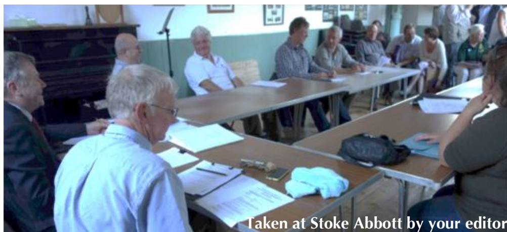
Taken at Stoke Abbott by your editor