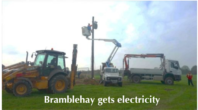
Bramblehay gets electricity

At Bramblehay it has in fact been the lack of an electric supply that has given Hastoe an extension of time beyond the 31 st March in order to still be able to pick up the agreed Government Grant. Being "Affordable" always seems to bring a cost to someone and with