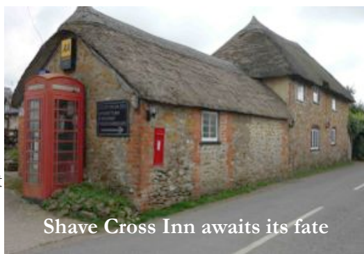
Shave Cross Inn awaits its fate

He added that the pub was listed as grade 2, was in an area of outstanding natural beauty and has been in existence for 700 years with great success under the last two owners. Several retrospective planning applications finally allowed for the already built increase of scale and size of the hotel, the pub and restaurant, but included a 106 agreement that tied the hotel to the pub and restaurant. Yet the sales document makes no mention of this vital agreement, strengthening the suspicion that there has been no real intention to actually sell Shave Cross Inn.