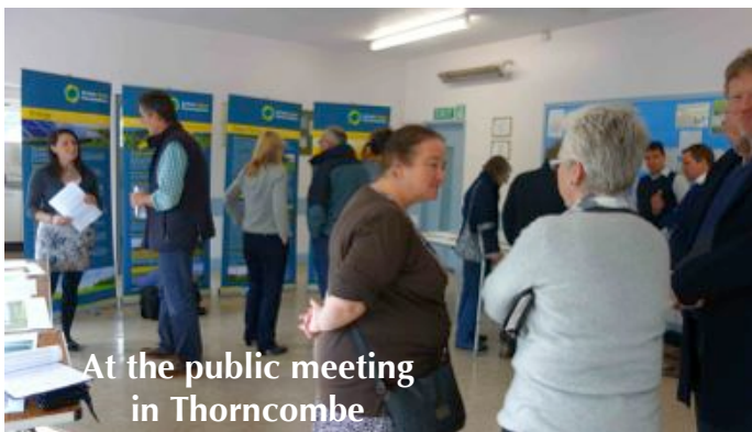
At the public meeting in Thorncombe

This unexpected compensation payable to Upper Marshwood Vale Parish Council could provide the much-needed funds for a number of projects including the reinstatement of the