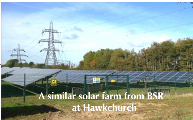
A similar solar farm from BSR at Hawkchurch

Planning consent is sought for a period of 25 years,