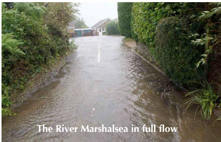
The River Marshalsea in full flow

On this particular morning the water went from larger puddles to licking the lip of my door in less than an hour. Working hard to clear drains to keep water away was limiting as they were at saturation point there was no way to alleviate this easily; thankfully I have the best neighbours who rallied and gathered materials to build a dam to channel