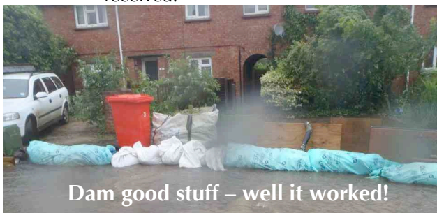
Dam good stuff – well it worked!

There was a steady and at times heavy flow created down the vale, which would have been in my home and probably at least one of my direct neighbours without the support received.