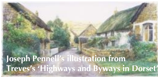
Joseph Pennell's illustration from Treves's 'Highways and Byways in Dorset'

Now it is practically impossible to pull out a drawbar when the waggon it tipping as it is very tight. But if Harry said a thing you couldn't turn him.