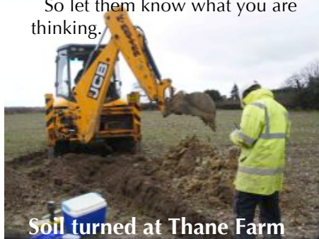
Soil turned at Thane Farm

BTV exists today as a direct result of our Parish Plan, as does the affordable homes project, so when your editor was asked to address some Loders residents on matters broadband, I felt well at home. The survey results handed out seemed remarkably similar even with the passage of time. With an active team debating the recommendations line-by-line, it seemed we were at the wellspring of local democracy. Such an operation usually takes place every 5 years, but ideas happen when needed or imagineered.