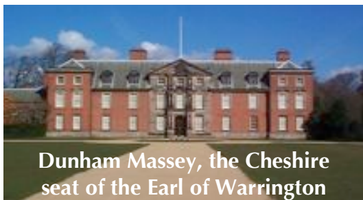
Dunham Massey, the Cheshire seat of the Earl of Warrington